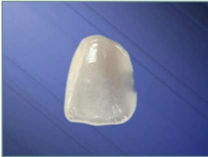
A translucent porcelain shell