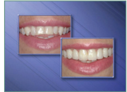
A dramatic improvement

A veneer is a thin shell of porcelain or plastic that is bonded to a tooth to improve its color and shape. A veneer generally covers only the front and top of a tooth. Veneers can be used to close spaces between teeth, lengthen small or misshapen teeth, or whiten stained or dark teeth. When teeth are chipped or beginning to wear, veneers can protect them from damage and restore their original appearance.