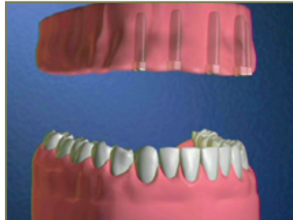
Multiple implants in place