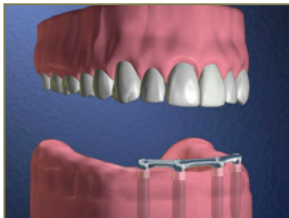
Lower jaw implants

Restoring your lower jaw with dental implants is accomplished in two phases. The first phase of the procedure is the surgical placement of the implants. They're under the gums for several months while the bone attaches to them. After healing, the second phase begins. We re-expose the implants and make your new teeth.